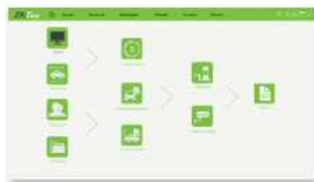
ZK Parking & ZKBioSecurity