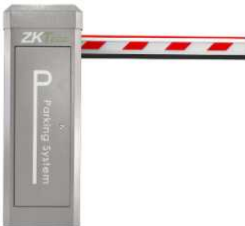
L: Case on the left side, and boom on the right side