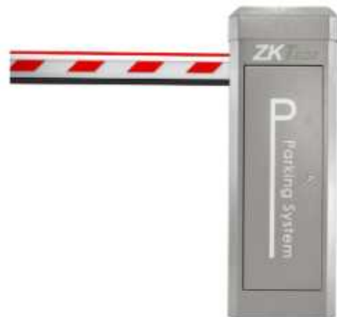
R: Case on the right side, and boom on the left side