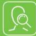
Touchless for Better Hygiene