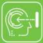
Proactive Facial Recognition