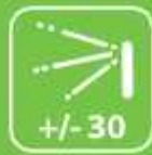
Wide Pose Angle Acceptance